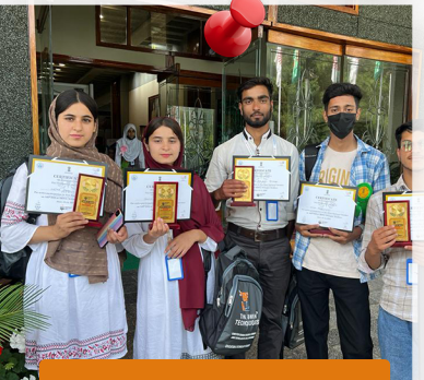
SKICC Education Expo